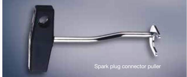
Spark plug connector puller