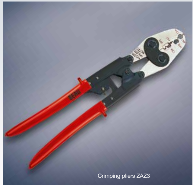
Crimping pliers ZAZ3

For secure installation of contact sleeves on ignition