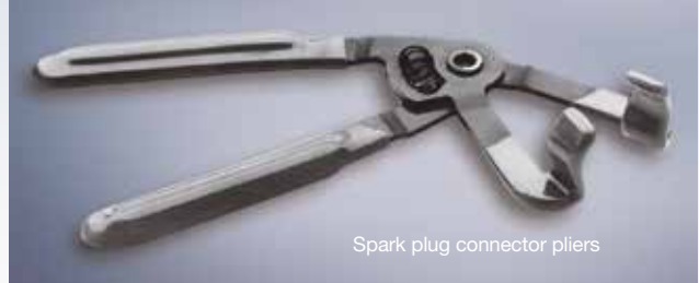
Spark plug connector pliers